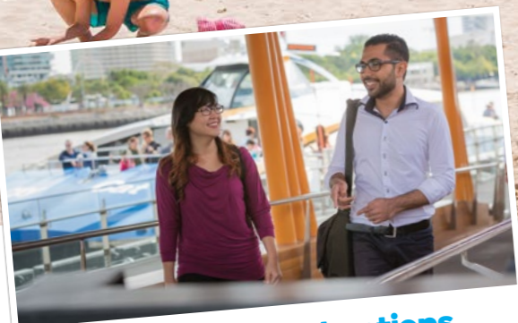
Great transport options