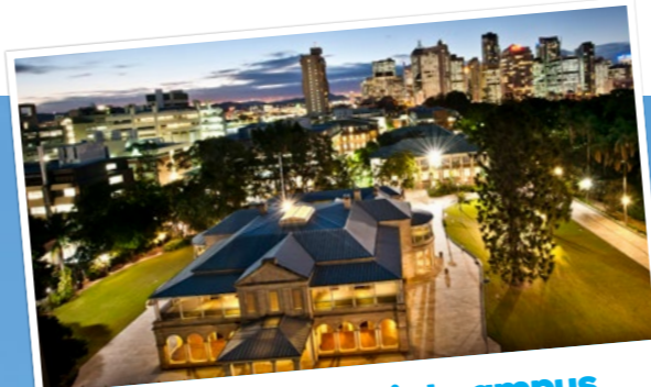
Gardens Point campus