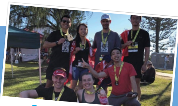
Social clubs and sport