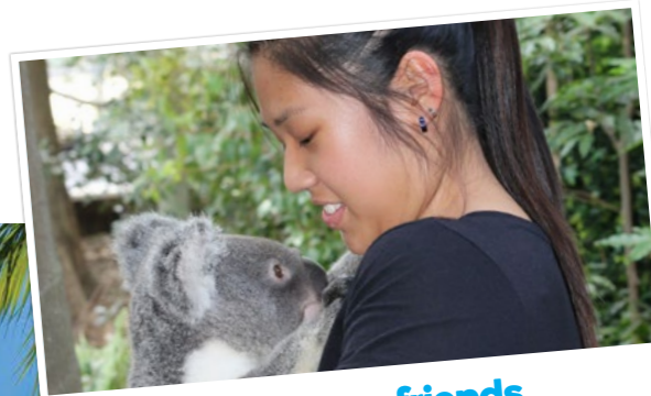
Make new friends