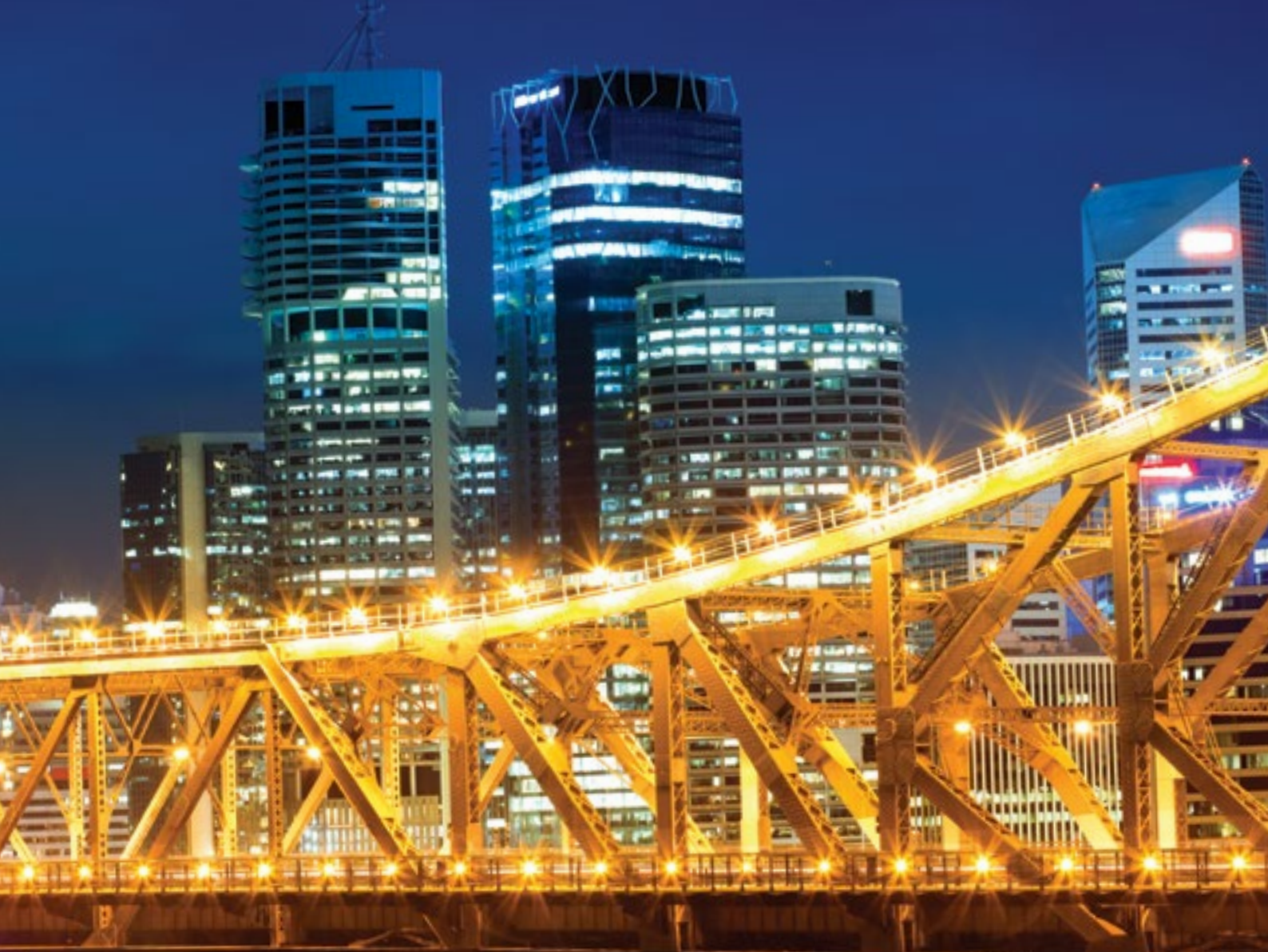
Story Bridge, Brisbane City